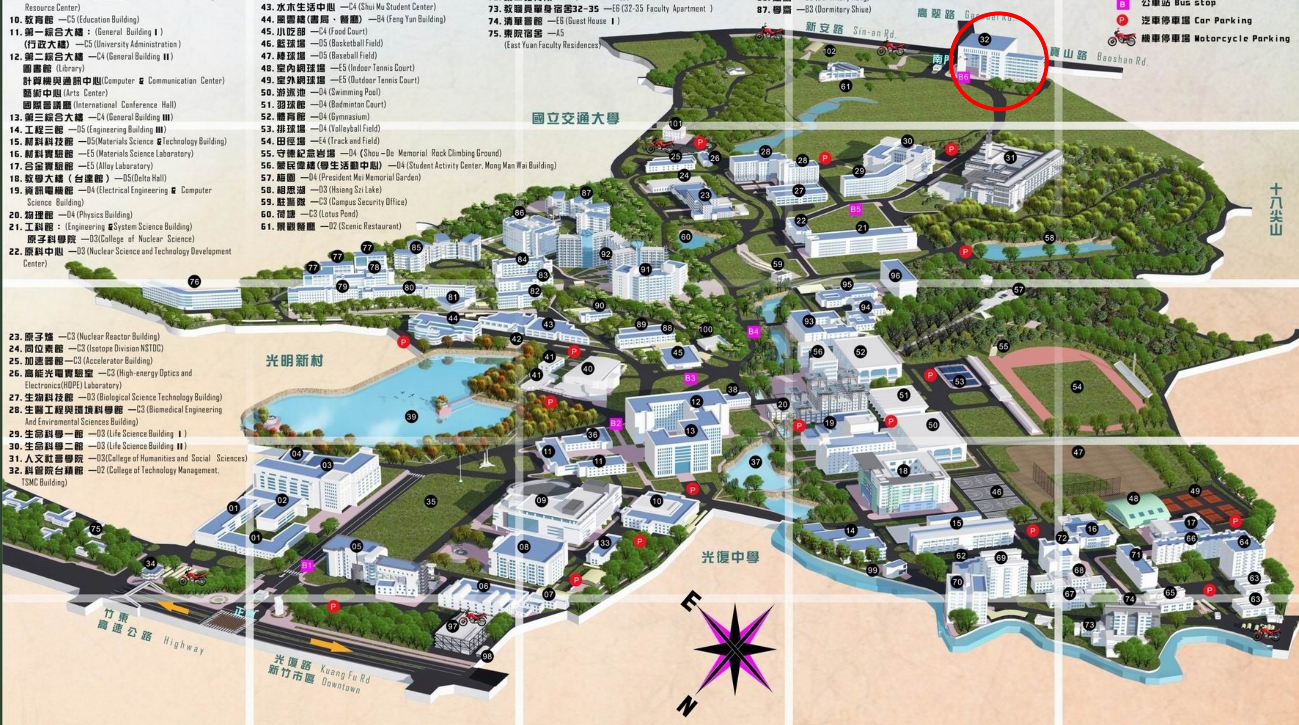
國立清華大學校園導覽圖 NTHU Campus Map