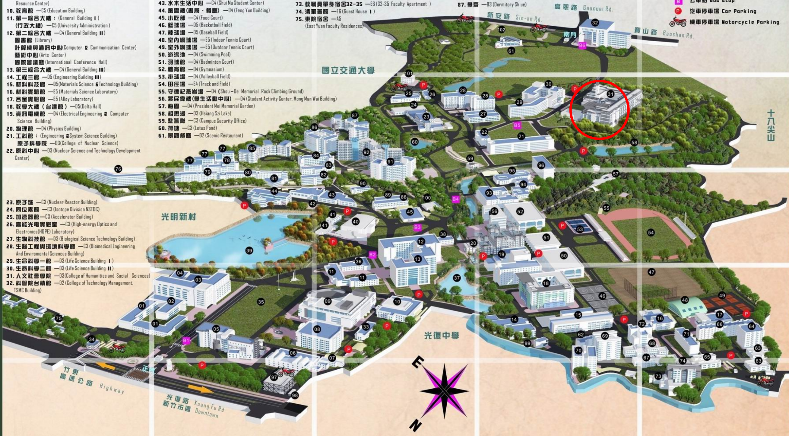
國立清華大學校園導覽圖 NTHU Campus Map